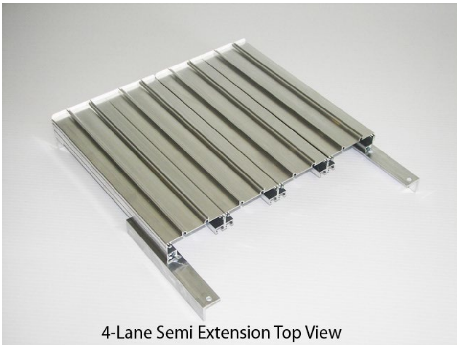
4-Lane Semi Extension Top View